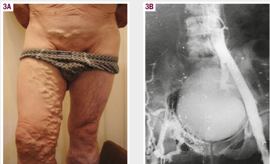
Fig. 3. A: PTS of the right lower extremity with varicose veins of the subcutaneous veins of the lower extremity and anterior abdominal wall. B: Phlebogram. Occlusion of the femoral-iliac and ilio-caval segments on the right.

joint, vein of Leonardo, Giacomini; for the femoral collector is the femoral vein and the sacral plexus; for iliac – internal iliac veins and veins of the anterior abdominal wall; for the iliac – azygos and semi azygos veins, lumbar veins and their venous plexuses, intervertebral and lower diaphragmatic veins, hepatic, gonadal veins and venous plexuses of the pelvis.