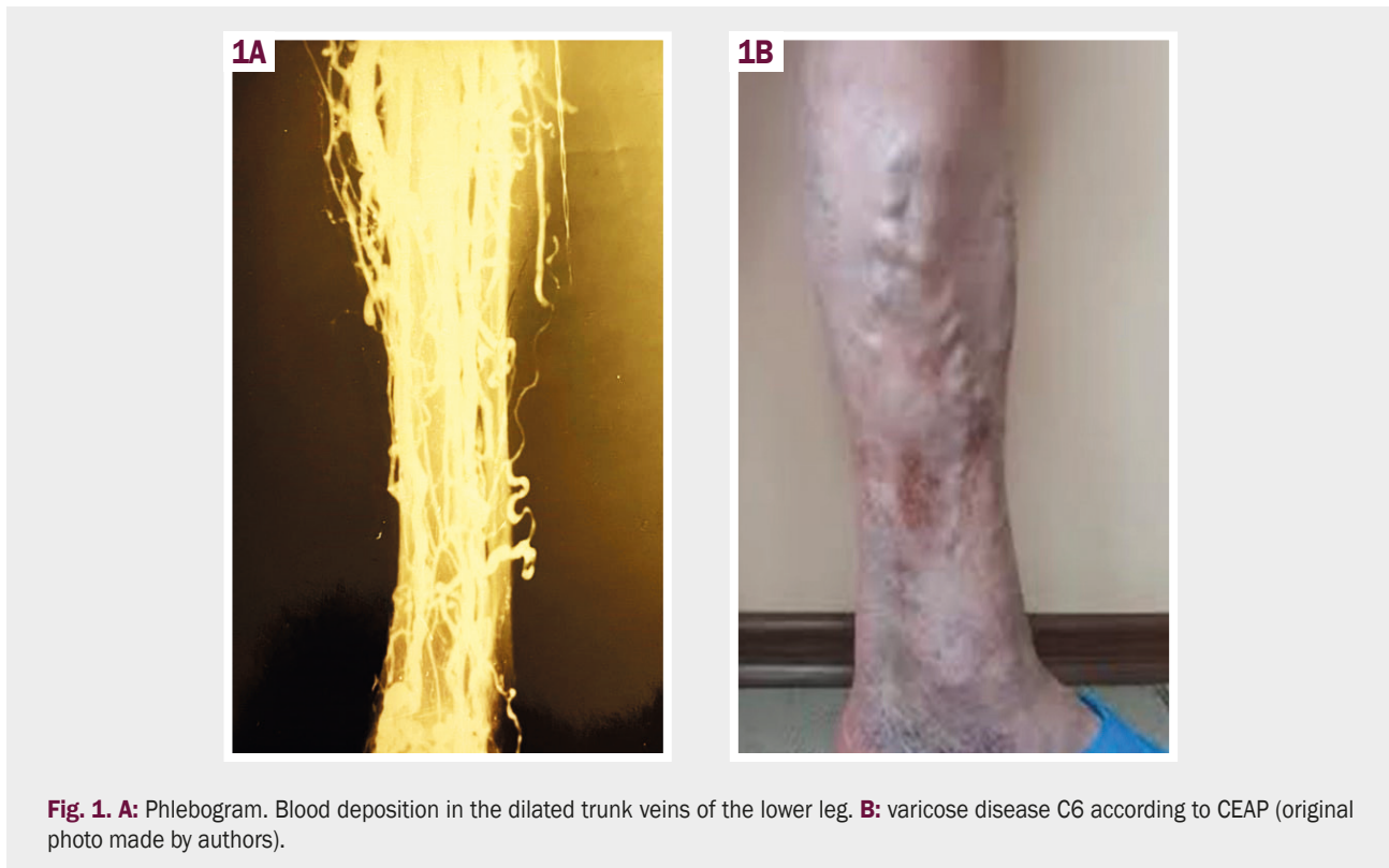
Fig. 1. A: Phlebogram. Blood deposition in the dilated trunk veins of the lower leg. B: varicose disease C6 according to CEAP.

occurred in 5–10 % patients with C6 TU with VD and almost in 35–40 % patients with PTS [1,2,3,4,5,15,16,17,18].